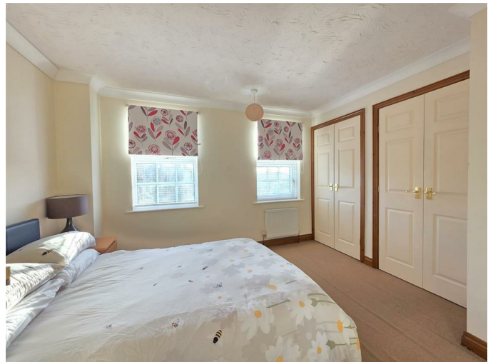
Bedroom 2 9'10" x 11'6" (3.02m x 3.53m)

Two PVC double glazed windows to rear. Coving to ceiling. Radiator. Two double door built in wardrobes with shelf and hanging rail. Tiled shower enclosure. Close couple toilet with push button flush. Pedestal wash hand basin with chrome mixer tap over.