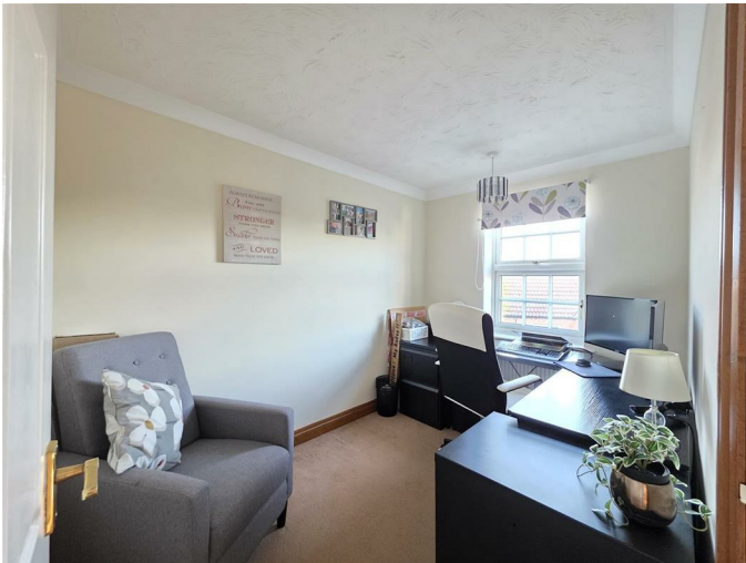
PVC double glazed window to front. Coving to ceiling. Radiator.