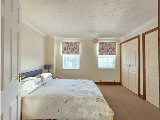
Bedroom 3 7'1" x 10'1" (2.17m x 3.09m)