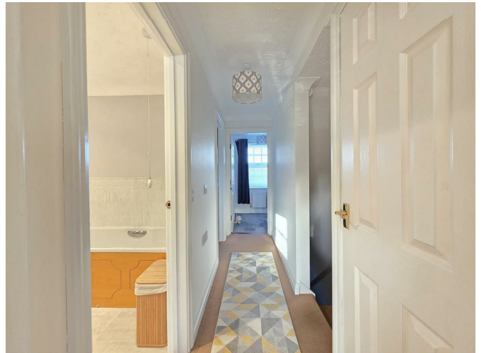
First Floor Landing 11'5" x 2'11" (3.48m x 0.89m)

PVC double glazed window to front. Coving to ceiling. Stairs to second floor. Airing cupboard with hot water cylinder and slatted shelving. Doors to bedroom 2, bedroom 3 and bathroom.