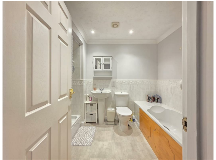
Coving to ceiling with recessed spot lighting. Extractor fan. Vinyl flooring. Heated towel rail. Shaver point. Fitted with a four piece suite with panel bath with chrome mixer tap