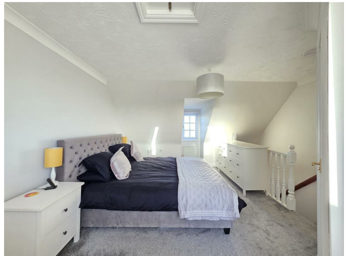
PVC double glazed window to front. Velux window to rear. Coving to ceiling. Three radiators. Loft access. Built in dressing table with storage. Door to en-suite.